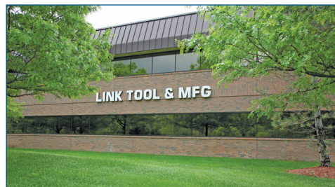
Headquarters: Westland, MI USA