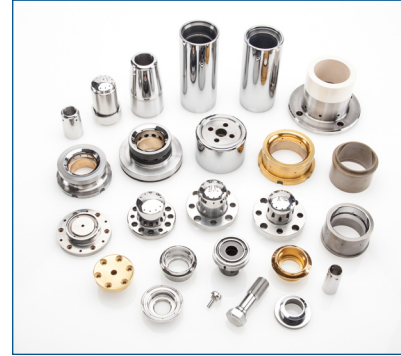
Experts in can industry tooling