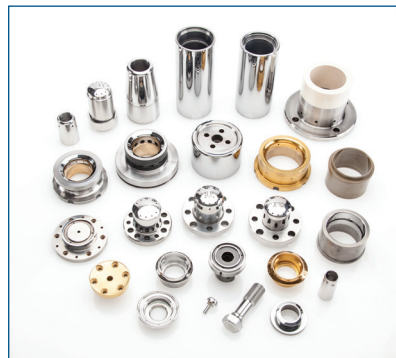
Experts in can industry tooling