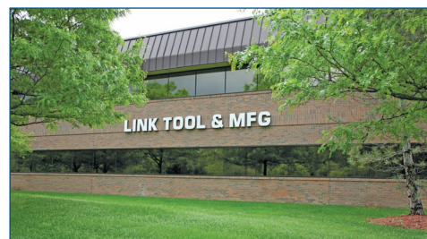
Headquarters: Westland, MI USA